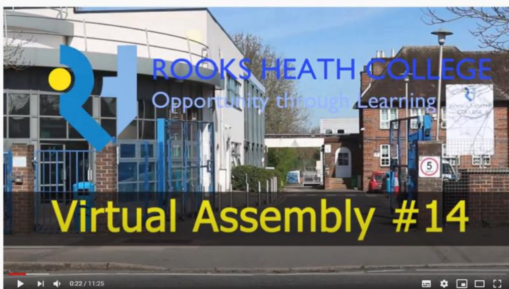
ROOKS HEATH COLLEGE VA14: Social distancing for years 10 and 12.