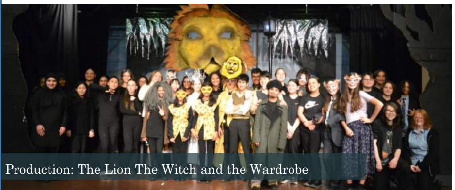
Production: The Lion The Witch and the Wardrobe

If you are a parent or carer, we would really like to hear your voice. Please consider joining our PTFA or attending one of my Parent Surgeries. The dates are within this newsletter. Please immerse yourself in the articles which have been carefully selected to share Rooks Heath Life with you. I hope you enjoy reading about them.