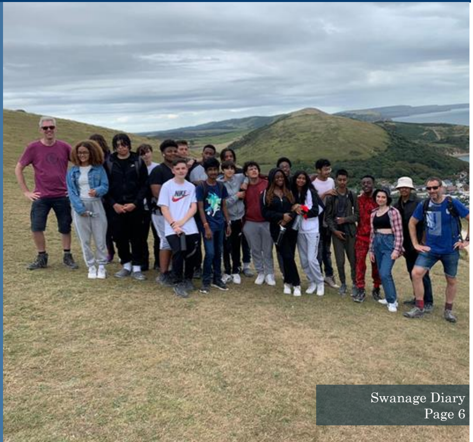
Swanage Diary Page 6