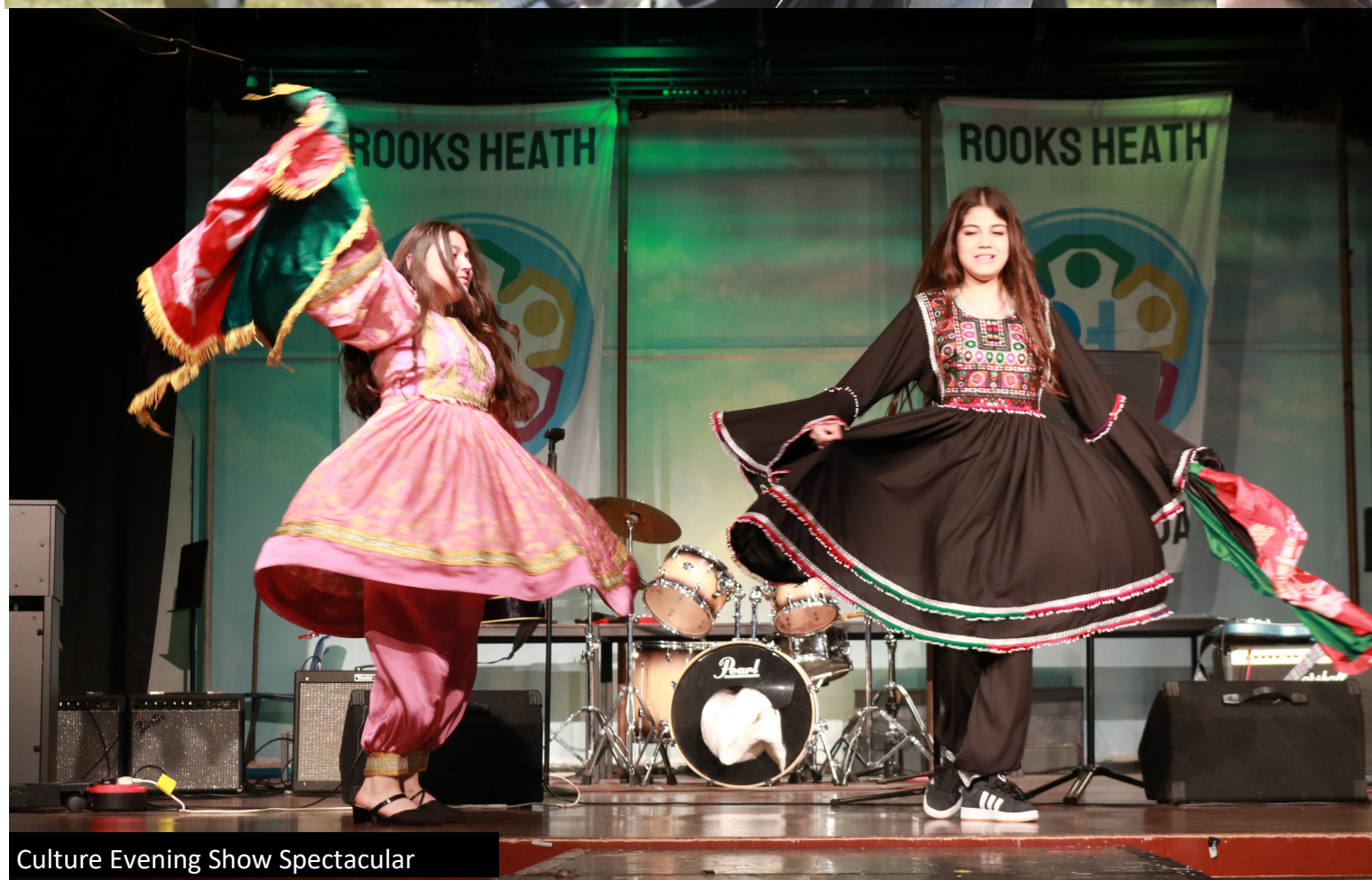
Culture Evening Show Spectacular