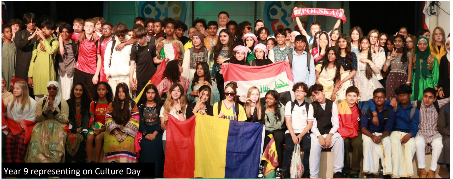
Year 9 representing on Culture Day